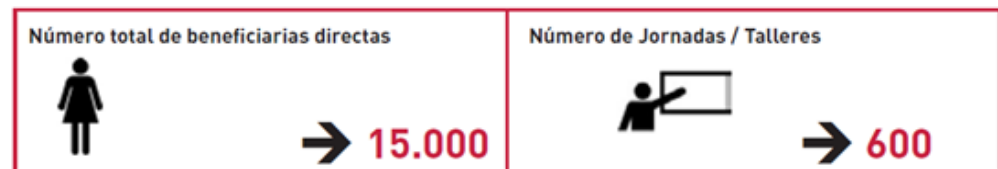
Principales indicadores de resultados del programa